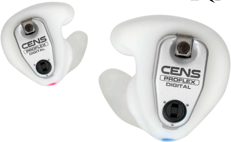
Attenuation Data Electronic Modules